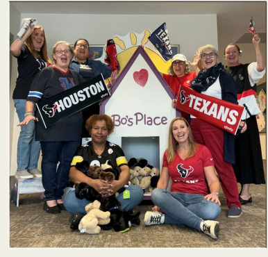
Texans Spirit Day 1.9.26