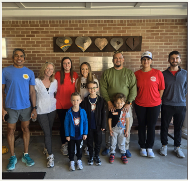
Team Bo's Place Kick-off 1.4.26