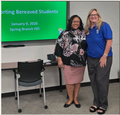
Spring Branch ISD Communities in Schools 1.9.26