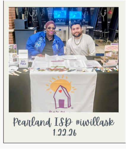
Pearland ISD #iwillask 1.22.26