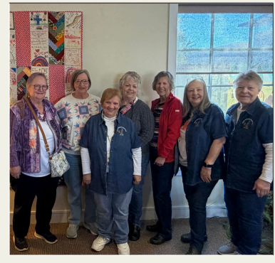
Coastal Prairie Quilt Guild 1.15.26