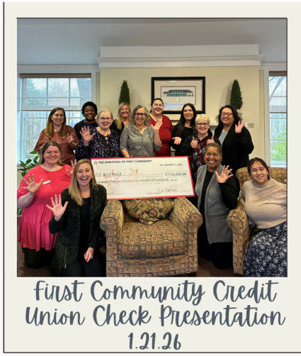
First Community Credit Union Check Presentation 1.21.26