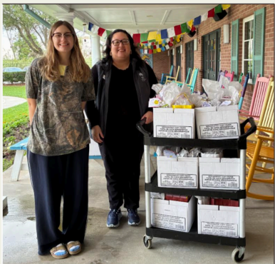
"Be the Change" Fort Settlement Middle School 1.9.26