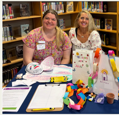
Duchesne Internship Fair 1.7.26