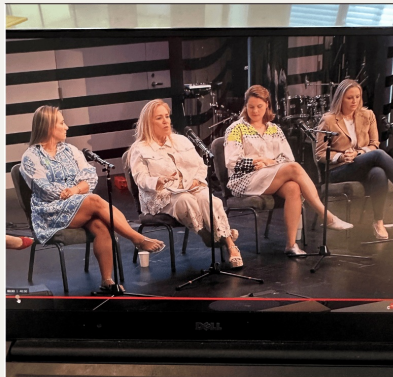
NFCC Grief and Loss Panel 5.8.25