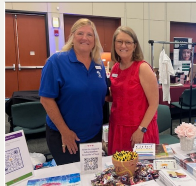
MB Anderson Mental Health Block Party 5.29.25